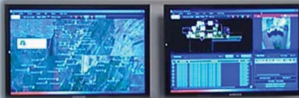
Command Center Integration

Video arrays can be defined for display. The arrays can be called by operator or automatically called on alarm event.